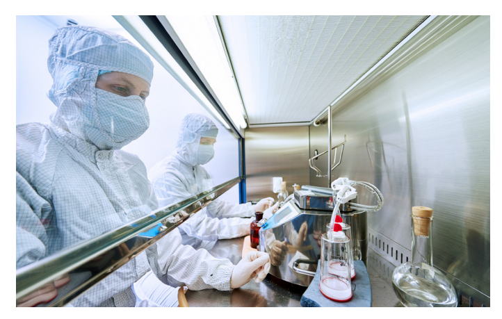
Gowned operator performing sterility testing in a laminar air flow hood

To reduce the risk of false positives, the sterility testing process should be performed in an aseptic environment. Historically, the common approach to achieve this was by performing the process in a biological safety cabinet (BSC) or laminar air flow (LAF) hood. However, this means the process is still open to the environment and operator, and thus there is still a risk of false positives occurring.